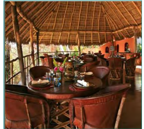
table service by a wait staff that is friendly, well trained and attentive to your every need. The well balanced meals are vegetarian in preparation and focused on good nutrition for healthy mind and body. Ingredients are fresh, natural and local. Special requests and seafood specialties can be included and special dietary needs are gladly accommodated.

Haramara's gourmet chef prepares three delicious meals daily with masterful artistic presentations. The spacious open-air palapa-roofed restaurant overlooks the jungle and ocean. It features world-class